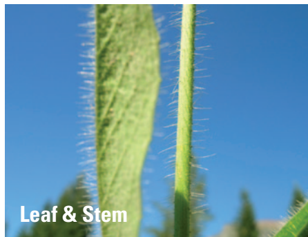
Leaf & Stem

Biological: The stolon-tip gall wasp Aulacidea subterminalis was first released in BC in 2011. Results are pending. 3